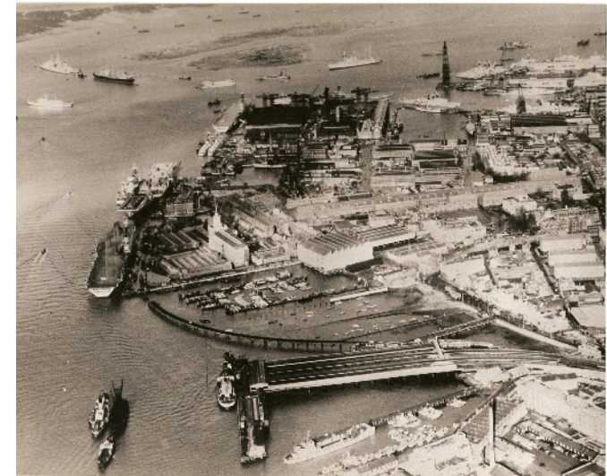
An aerial view of Portsmouth Naval Dockyard circa 1959 /1960 looking North .

Sponsored by Portsmouth Naval Base Property Trust Which is responsible for the restoration, interpretation and future use of the historic buildings in Portsmouth Dockyard