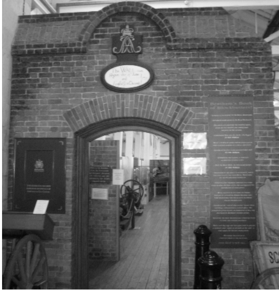
Entrance to the Dockyard Apprentice exhibition.

The Support Group are in reality the working Group of the Trust, and still fulfil the role of collecting, storing, restoring, researching and recording Dockyard related material, and to a limited extent, exhibiting small new displays from time to time within the framework of the Dockyard Apprentice